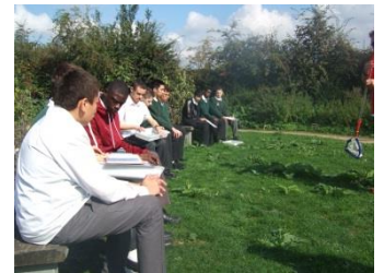
group being briefed

The site has been leased to the Regional Park since 1988. Each disused filter bed is managed so as to provide a variety of habitats for wildlife.