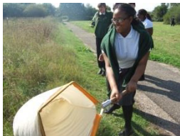
Precious is in the long fields using a net to catch insects

In 1969, after over 100 years in operation, the Middlesex Filter Beds had become outdated and were replaced by the new Coppermills Water Treatment Works located in Walthamstow. Thames Water became responsible for the beds in 1974 but nature had already taken over and plants as well as other wildlife had begun to colonise the abandoned site.