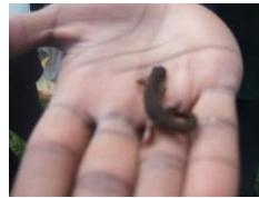
A newt from an aquatic habitat

In 1969, after over 100 years in operation, the Middlesex Filter Beds had become outdated and were replaced by the new Coppermills Water Treatment Works located in Walthamstow. Thames Water became responsible for the beds in 1974 but nature had already taken over and plants as well as other wildlife had begun to colonise the abandoned site.