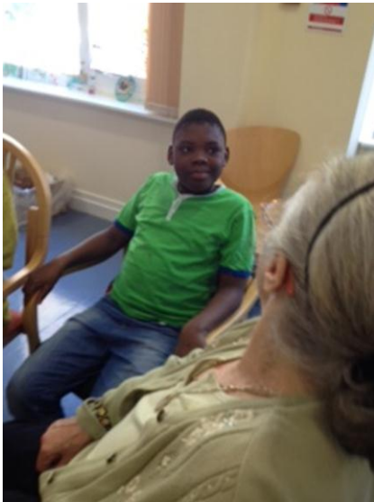
Credo relaxing with a day patient

Last Thursday 7W began visiting St. Joseph's Hospice in Mare Street. The class has been divided into two groups. Each week one group goes to the Hospice to spend some time with the Day Patients. Before each visit the pupils prepare a topic that they will talk about. They also read and complete different activities. The pupils have benefitted already from the visits. Their confidence is growing and is helping them with their preparations with their Skype calls to Taiwan as part of the Connecting Classrooms project.