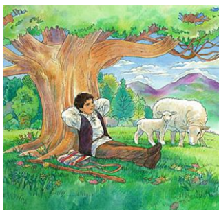
The Boy who Cried Wolf