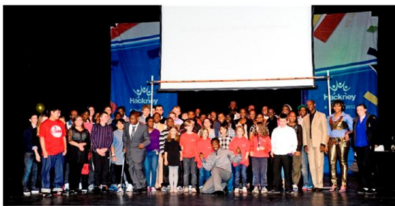
London Youth Games Medallists