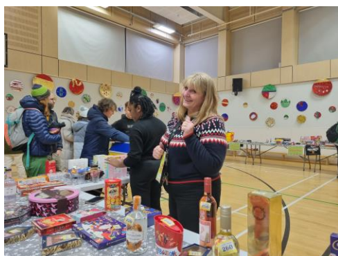
Some great prizes on the tombola...

...and not forgetting an appearance from Santa Claus!