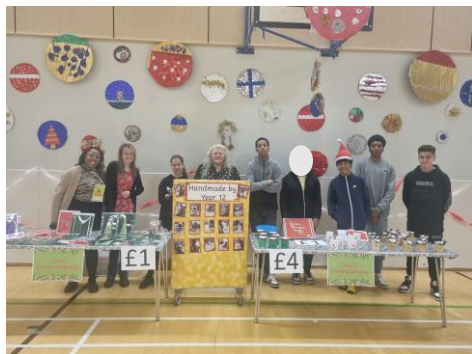
Year 12 Enterprise did an amazing job selling their handmade products.

A massive thank you to everyone who contributed to making our first Winter Fair a success. The Friends of Stormont Elves put on a fantastic event, and we are proud to say we raised a total of £1,236.75 for the school. Keep an eye out for an update on where the money goes, and for details of the next event. We loved opening our doors to you all, and can't wait to welcome you back soon.