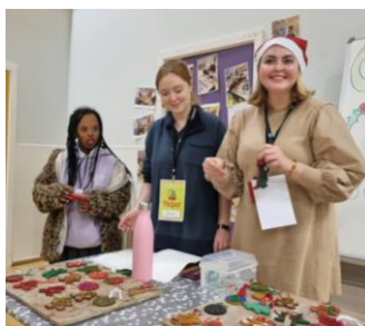
Our Arts and Crafts club sold their beautiful decorations.