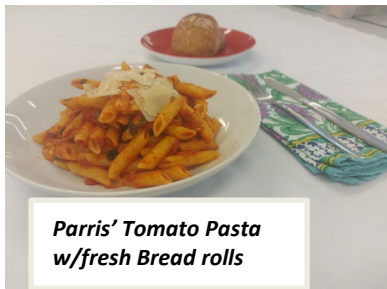
Parris' Tomato Pasta w/fresh Bread rolls