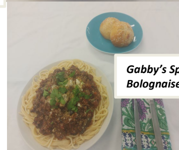
Gabby's Spaghetti Bolognese w/fresh Bread