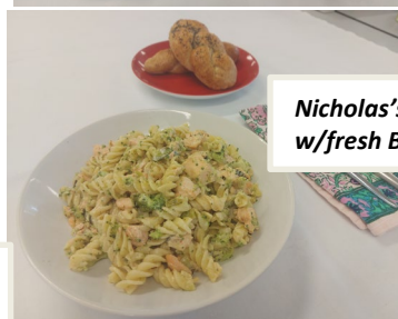
Nicholas's Salmon Pasta w/fresh Bread rolls