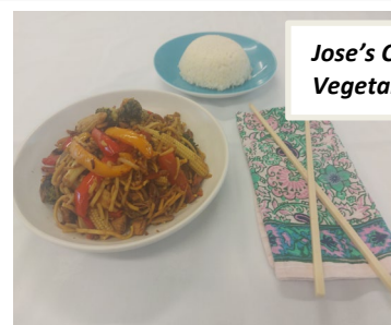
Jose's Chicken and Vegetable Stir Fry