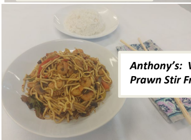
Anthony's: Veg & Prawn Stir Fry