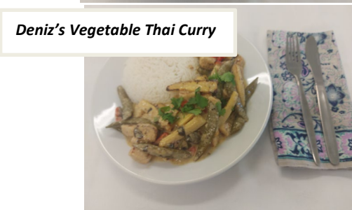
Deniz's Vegetable Thai Curry