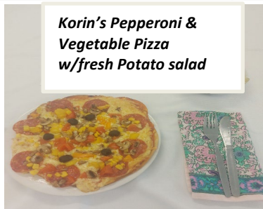
Korin's Pepperoni & Vegetable Pizza w/fresh Potato salad