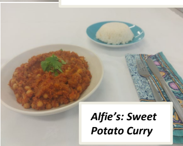
Alfie's: Sweet Potato Curry