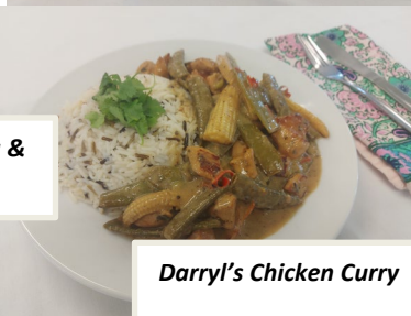
Darryl's Chicken Curry