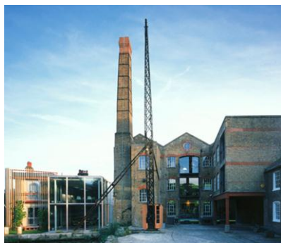
Diespecker Wharf Islington