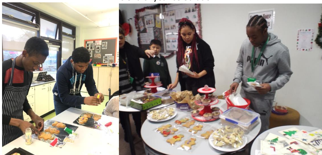
Pictures from last year's Cake Sale and Year 12's preparing the cakes and biscuits

Year 12 students have been taking part in an Enterprise Project as part of their BTEC Workskills qualification. The students will be making cakes to sell on the stall, but we are asking if you could please donate cakes and biscuits for us to sell on the stall. The cakes will be sold during break and lunch time, with a small cost of 50p each. If you are unable to send in a cake donation, can you please send your child in with money to buy cakes. All profits from the sale will be split between a local charity and funding for the Year 12's end of year celebration.